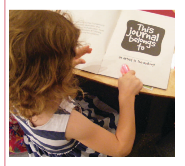
12 January until 29 January 2012 Pinnacles Gallery

Public Exposure promoted the exhibitions and public programs that were a part of the Pinnacles Gallery 2012 program.