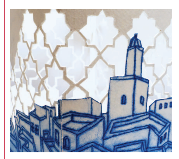
PressNorth 6 October until 11 November 2012 Pinnacles Gallery

Out of the Box is the first, large public group exhibition by members of the north Queensland based printmakers collective, PressNorth.