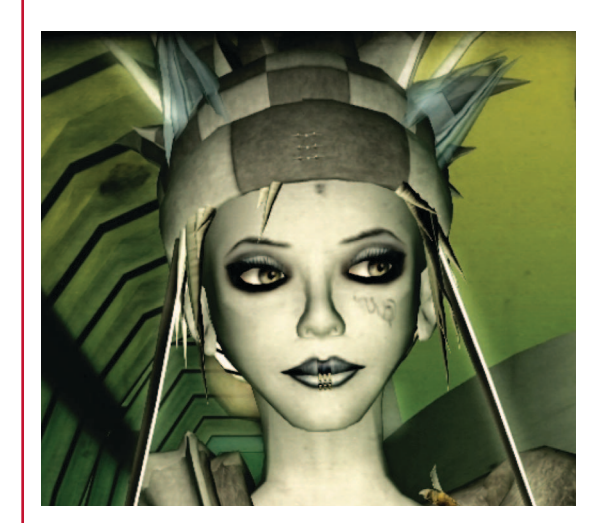
A Queensland University of Technology Touring Exhibition 4 February until 1 April 2012 Pinnacles Gallery