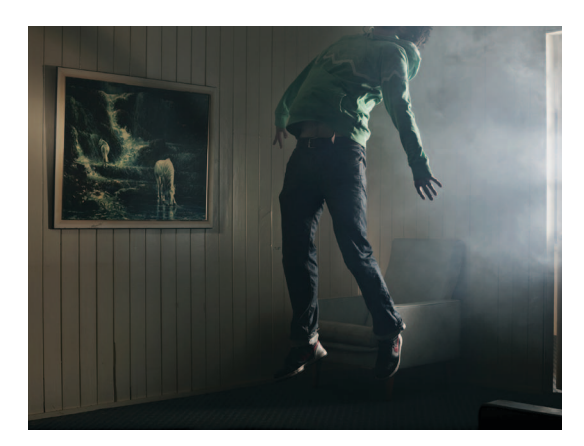
Presented by the Endeavour Foundation 22 February until 28 March 2012 Your Space

The exhibition showcased photographic work by artists with disabilities from around Queensland, showing that people with a disability have a story to share if we are willing to listen.