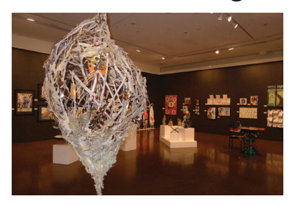
North Queensland Regional Exhibition in conjunction with ART NOW 1 September until 30 September 2012 Pinnacles Gallery

The Creative Generation Excellence Awards in Visual Art recognise and promote excellence in senior visual arts education throughout Queensland state and non-state schools.