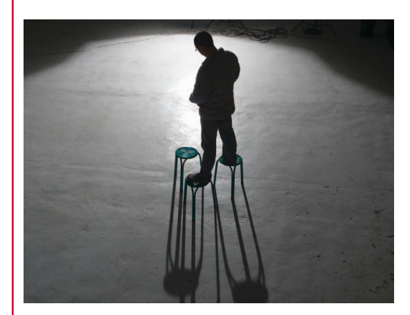
An IDAP and Platform China Touring Exhibition 9 June until 15 July 2012 Pinnacles Gallery

Featuring six artists from a new, young generation of video artists in China, Impossible Universe: Now Here presented the freshest and most genuine video work emerging from contemporary art practice in China.