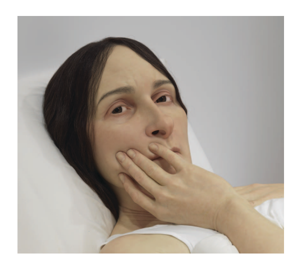
A Queensland Art Gallery Travelling Exhibition 19 November 2011 until 8 January 2012 Pinnacles Gallery

Australian-born, London-based sculptor Ron Mueck's sculptures are some of the most widely acclaimed and identifiable works in the international contemporary art arena.