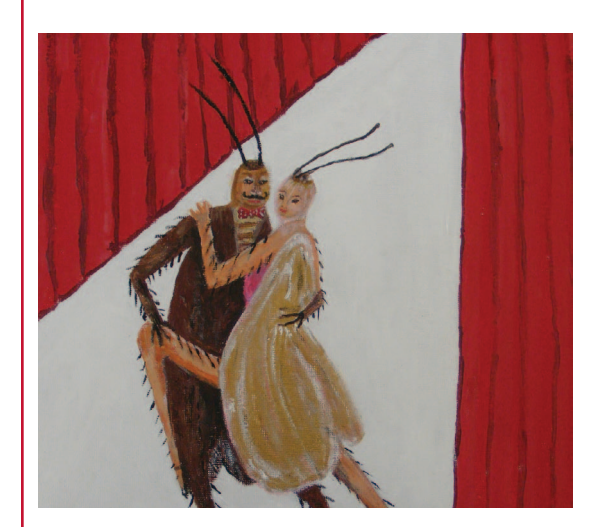
Kelso Art Group 14 December 2011 until 18 January 2012 Your Space

The Kelso Art Group's annual exhibition took aim at introduced species and pests...with a touch of humour of course.