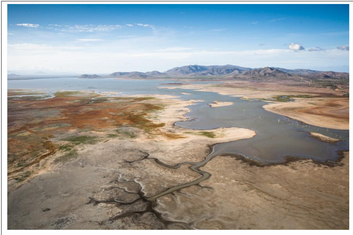
Ross River Dam October 2016