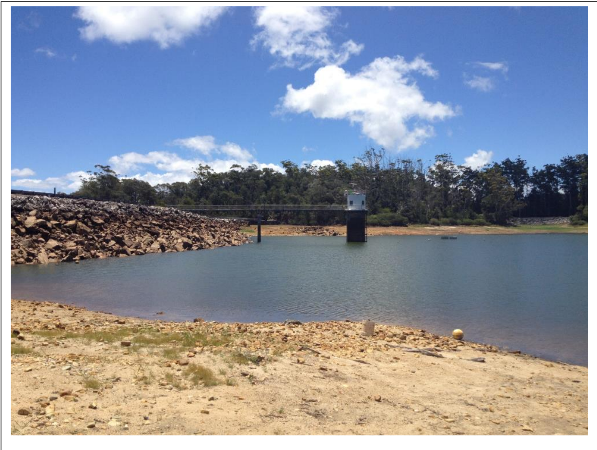
Paluma Dam December 2015

No research activities were undertaken in the 16/17 financial year.