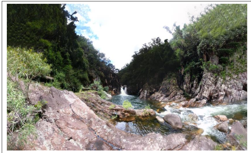
Crystal Creek Intake

33,341ML of potable water was produced in the 16/17 financial year. Townsville Water maintains 2 dams (Ross River Dam and Paluma Dam), 2 Weirs (Paluma Weir and Blacks Weir), 23 water pumping stations, 41 reservoirs (water storage facilities) and 2,585 km of water distribution mains.