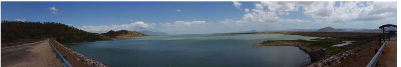
Ross River Dam